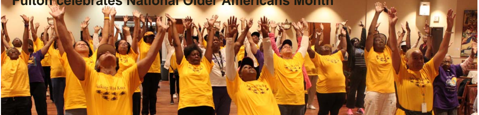
Seniors participate in Women's Walk for Wellness during the 2014 Older Americans Month celebration.

When President John F. Kennedy signed the Proclamation designating May as "Senior Citizens Month" in April 1963, he said our seniors represented "a great national resource of skills, wisdom, and experience upon which much of our nation's progress has been built and which continues to enrich our daily lives and to provide counsel and leadership."