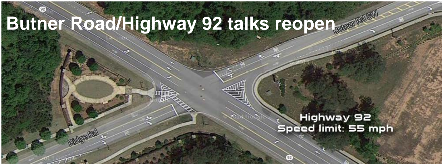
State Highway 92 at the intersection of Ridge Road and Butner Road.

In response to signed documents prepared by residents of the surrounding communities, Georgia Department of Transportation (GDOT) and County officials have reopened discussions related to the improvement of the “Butner Road/Highway 92” area.